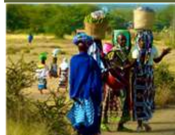
Local Tanzanian women transporting goods with incredible balance.

3. It will challenge you - in a good way!