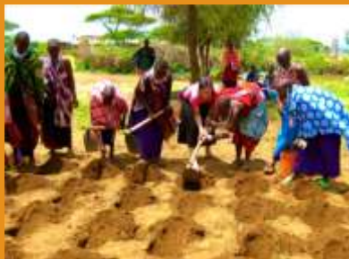
A GSC volunteer farming alongside Maasai women in Tanzania.

1. Serving alongside local professionals will give you perspective.