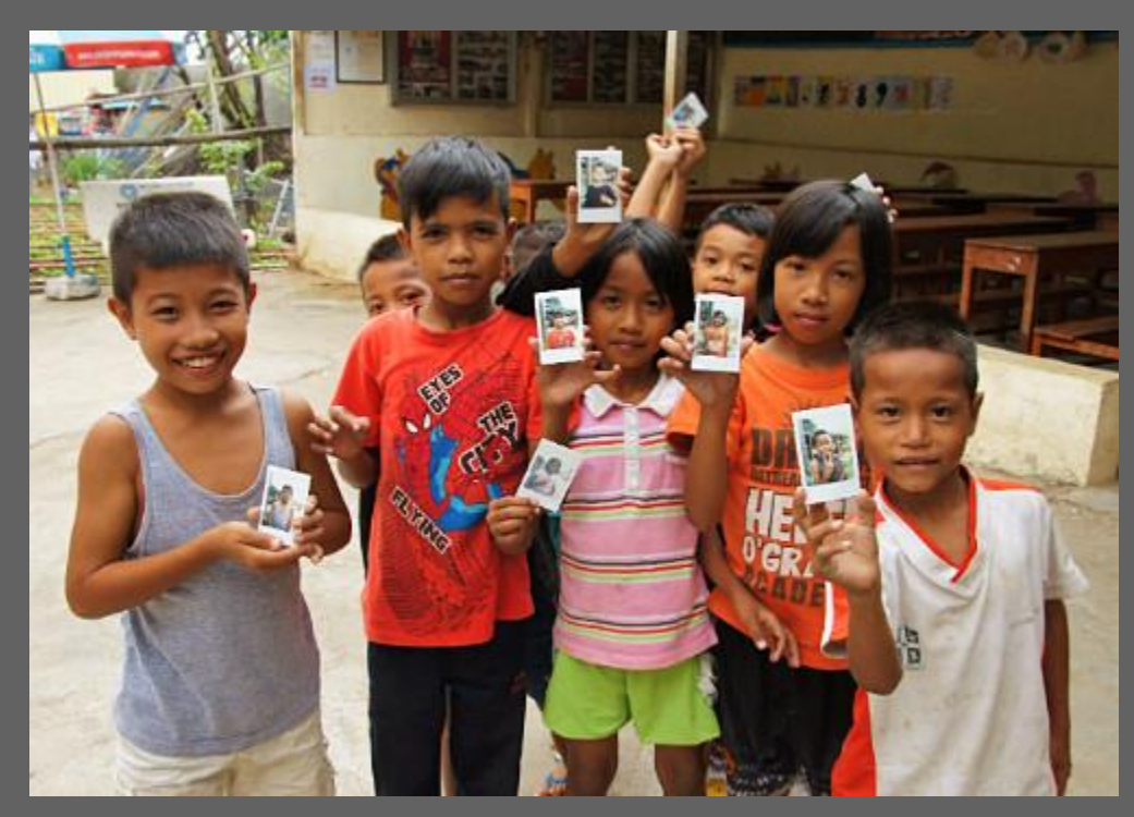
A group of children show off Polaroids at one of GSC's partner organizations.

help support GSC and the disadvantaged communities we serve in Cambodia.