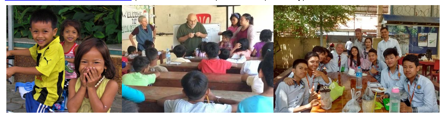
English & Leadership Day Camp Program (Teaching experience not required)

The Child and Orphanage Care program provides opportunities for participants to assist the GSC local partner organization in providing care, education and psycho-social support to orphans and/or marginalized kids aged 3 to 18. Participants teach English (prior teaching experience not required), or other skills, provide arts and crafts activities and engage in recreational and other support activities. Participants with specific hobby or educational backgrounds and skills are welcomed to share these. Accommodations are provided at the headquarters apartment of our partner organization and include delicious Khmer food and air-conditioned double rooms with modest Western bathrooms. See <a href="https://globalservicecorps.org/child-and-orphan-care-volunteer-program-in-cambodia/">https://globalservicecorps.org/child-and-orphan-care-volunteer-program-in-cambodia/</a> (Urban Children's Orphan Care option only)